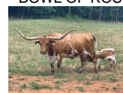
BOWL OF ROSES