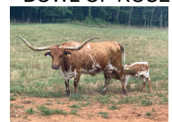
BOWL OF ROSES